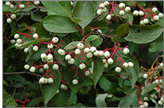
Gray Dogwood fruit