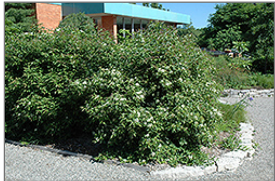
Gray Dogwood in bloom