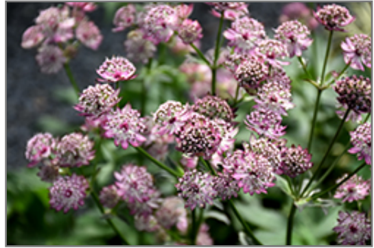
Abbey Road Masterwort flowers