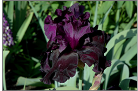
Black Is Black Iris flowers