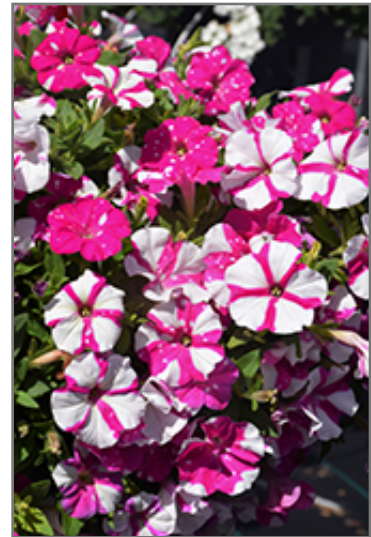
Headliner Pink Sky Petunia flowers

Headliner Pink Sky Petunia is recommended for the following landscape applications;