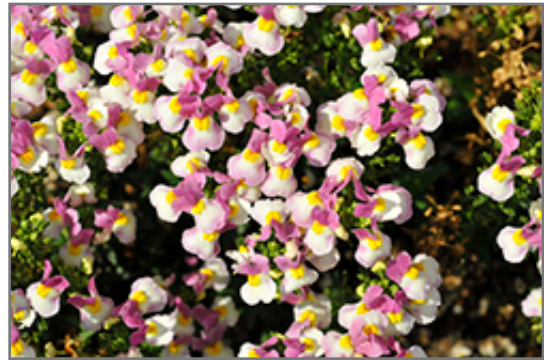
Escential Pinkberry Nemesia flowers