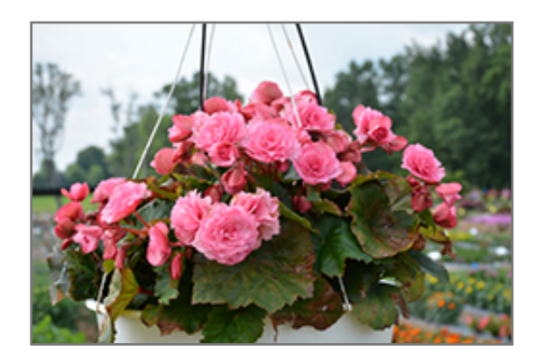
Frivola Pink Begonia in bloom

Frivola Pink Begonia will grow to be about 12 inches tall at maturity, with a spread of 12 inches. When grown in masses or used as a bedding plant, individual plants should be spaced approximately 8 inches apart. Its foliage tends to remain dense right to the ground, not requiring facer plants in front. Although it's not a true annual, this plant can be expected to behave as an annual in our climate if left outdoors over the winter, usually needing replacement the following year. As such, gardeners should take into consideration that it will perform differently than it would in its native habitat.