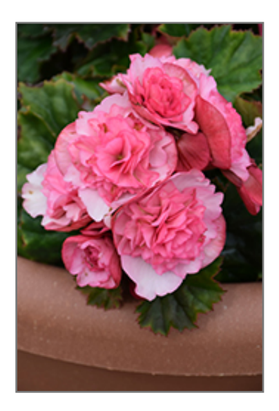
Frivola Pink Begonia flowers

Wolf Hill Ipswich 60 Turnpike Rd (Route 1) Ipswich, MA 01938 978-356-6342