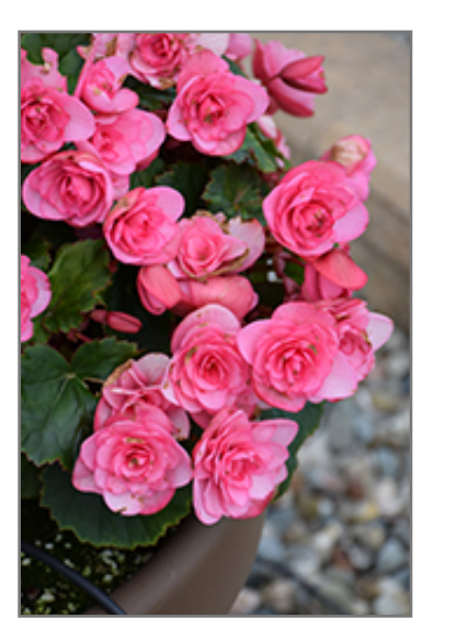
Frivola Pink Begonia flowers