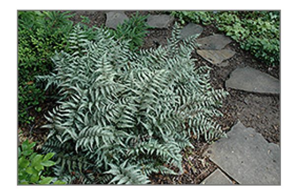
Japanese Painted Fern

Wolf Hill Ipswich 60 Turnpike Rd (Route 1) Ipswich, MA 01938 978-356-6342