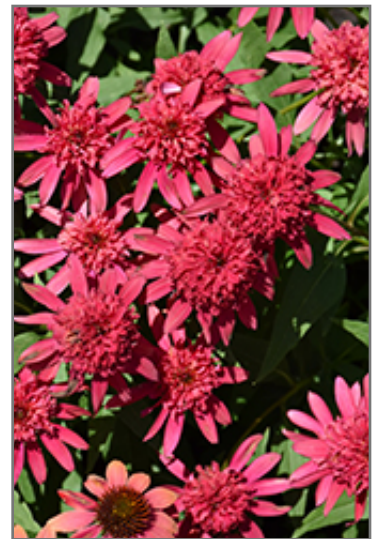
Double Scoop Raspberry Coneflower flowers