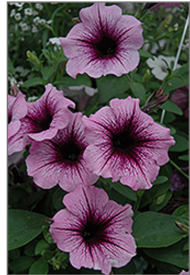
Supertunia Bordeaux Petunia flowers