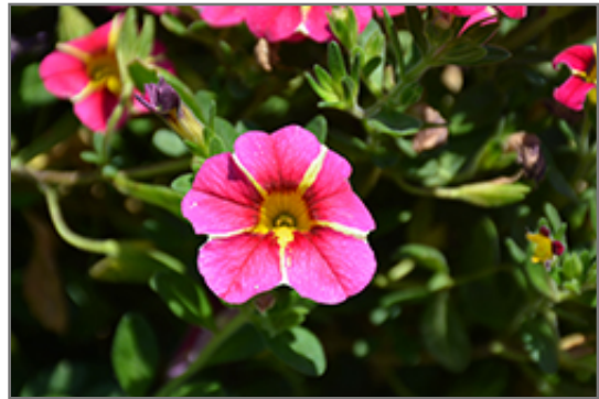
Superbells Cherry Star Calibrachoa flowers

Superbells Cherry Star Calibrachoa is a dense herbaceous annual with a trailing habit of growth, eventually spilling over the edges of hanging baskets and containers. Its medium texture blends into the garden, but can always be balanced by a couple of finer or coarser plants for an effective composition.