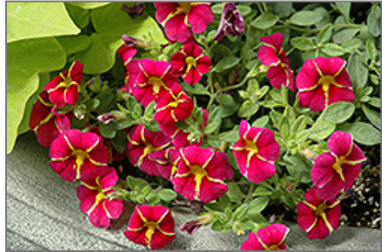
Superbells Cherry Star Calibrachoa flowers

Superbells Cherry Star Calibrachoa is a fine choice for the garden, but it is also a good selection for planting in outdoor containers and hanging baskets. Because of its trailing habit of growth, it is ideally suited for use as a 'spiller' in the 'spiller-thriller-filler' container combination; plant it near the edges where it can spill gracefully over the pot. Note that when growing plants in outdoor containers and baskets, they may require more frequent waterings than they would in the yard or garden.