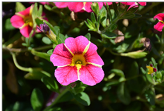
Superbells Cherry Star Calibrachoa flowers

Superbells Cherry Star Calibrachoa is a dense herbaceous annual with a trailing habit of growth, eventually spilling over the edges of hanging baskets and containers. Its medium texture blends into the garden, but can always be balanced by a couple of finer or coarser plants for an effective composition.