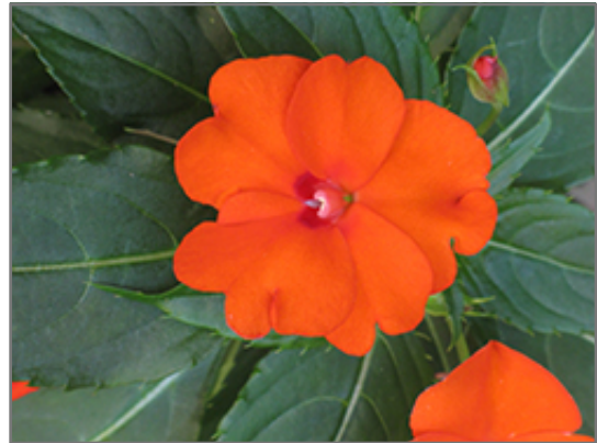
Infinity Orange New Guinea Impatiens flowers

Infinity Orange New Guinea Impatiens is recommended for the following landscape applications;