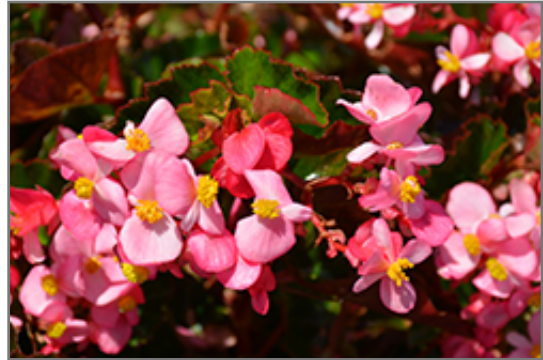
BabyWing Pink Begonia flowers