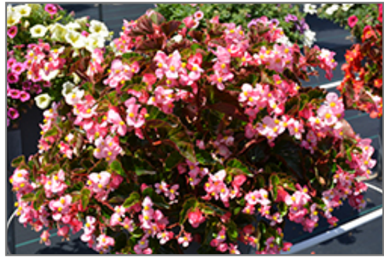
BabyWing Pink Begonia in bloom

BabyWing Pink Begonia is a fine choice for the garden, but it is also a good selection for planting in outdoor containers and hanging baskets. It is often used as a 'filler' in the 'spiller-thriller-filler' container combination, providing a mass of flowers and foliage against which the thriller plants stand out. Note that when growing plants in outdoor containers and baskets, they may require more frequent waterings than they would in the yard or garden.