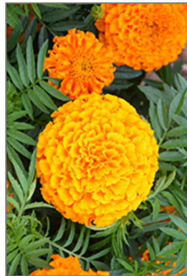
Taishan Orange Marigold flowers