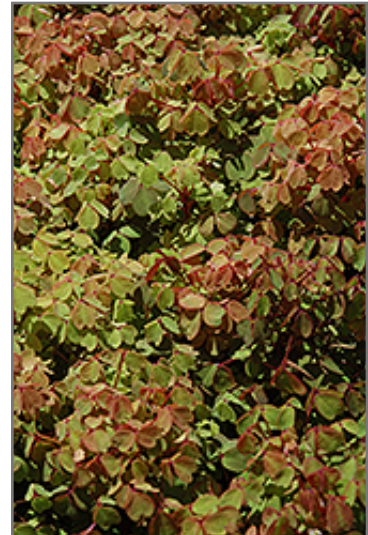
Sunset Velvet Shamrock foliage