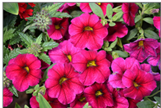
Superbells Cherry Red Calibrachoa flowers