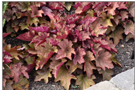
Carnival Watermelon Coral Bells