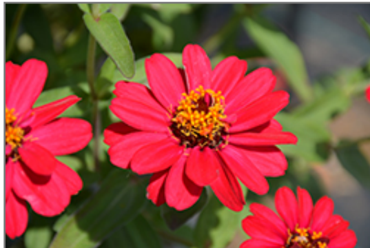
Profusion Double Hot Cherry Zinnia flowers