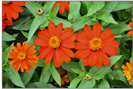
Zahara Fire Zinnia flowers

Zahara Fire Zinnia is recommended for the following landscape applications;