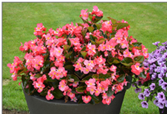
Surefire Rose Begonia in bloom