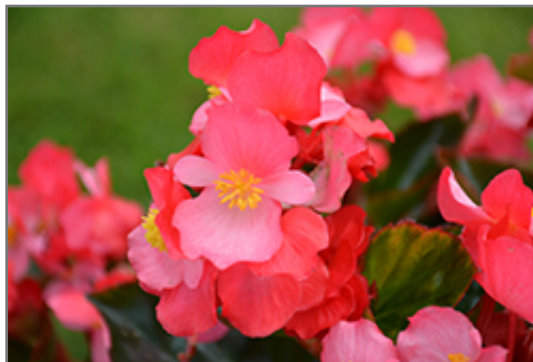
Surefire Rose Begonia flowers

Surefire Rose Begonia is an herbaceous annual with an upright spreading habit of growth. Its medium texture blends into the garden, but can always be balanced by a couple of finer or coarser plants for an effective composition.