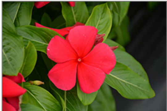
Titan Dark Red Vinca flowers

Titan Dark Red Vinca is recommended for the following landscape applications;