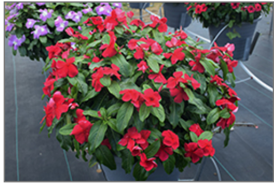
Titan Dark Red Vinca in bloom

Titan Dark Red Vinca will grow to be about 14 inches tall at maturity, with a spread of 12 inches. Its foliage tends to remain dense right to the ground, not requiring facer plants in front. Although it's not a true annual, this fast-growing plant can be expected to behave as an annual in our climate if left outdoors over the winter, usually needing replacement the following year. As such, gardeners should take into consideration that it will perform differently than it would in its native habitat.