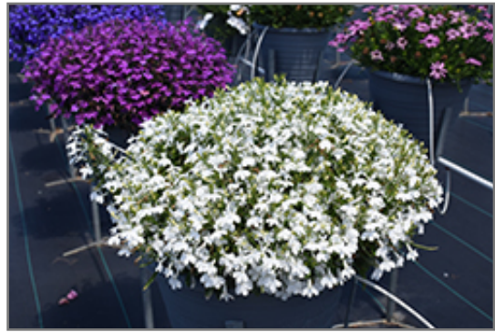
Techno Upright White Lobelia in bloom

Techno Upright White Lobelia is a fine choice for the garden, but it is also a good selection for planting in hanging baskets. Because of its trailing habit of growth, it is ideally suited for use as a 'spiller' in the 'spiller-thriller-filler' container combination; plant it near the edges where it can spill gracefully over the pot. Note that when growing plants in outdoor containers and baskets, they may require more frequent waterings than they would in the yard or garden.