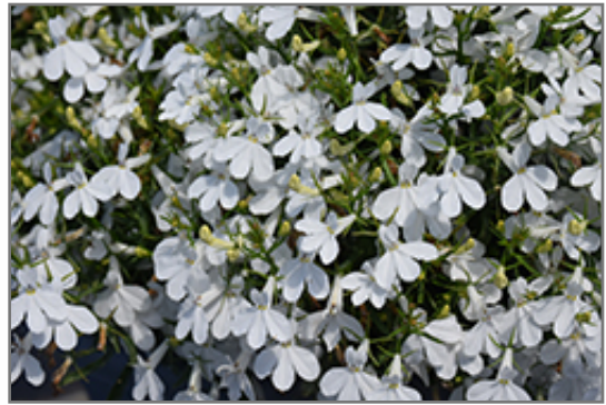
Techno Upright White Lobelia flowers

Techno Upright White Lobelia is recommended for the following landscape applications;