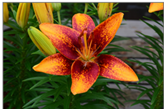
Lily Looks Tiny Orange Sensation Lily flowers