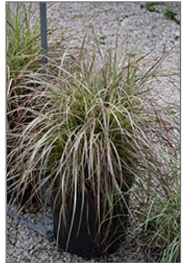
Cherry Sparkler Fountain Grass foliage

Cherry Sparkler Fountain Grass is a fine choice for the garden, but it is also a good selection for planting in outdoor pots and containers. It can be used either as 'filler' or as a 'thriller' in the 'spiller-thriller-filler' container combination, depending on the height and form of the other plants used in the container planting. It is even sizeable enough that it can be grown alone in a suitable container. Note that when growing plants in outdoor containers and baskets, they may require more frequent waterings than they would in the yard or garden.