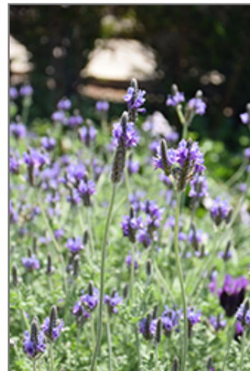
Fernleaf Lavender flowers

Fernleaf Lavender is recommended for the following landscape applications;