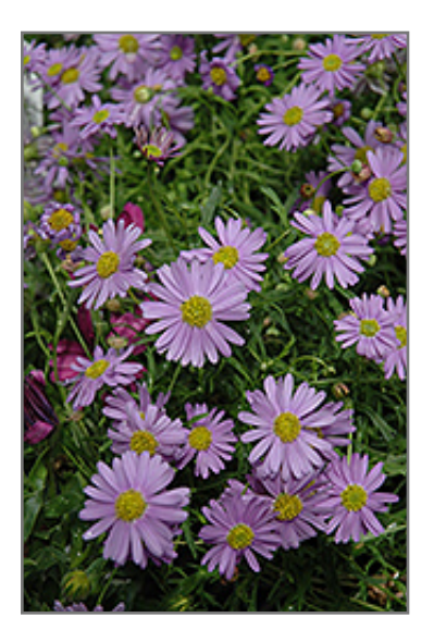
Blue Zephyr Brachyscome flowers