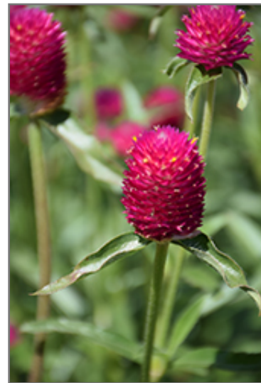
Qis Carmine Gomphrena flowers

Qis Carmine Gomphrena is recommended for the following landscape applications;