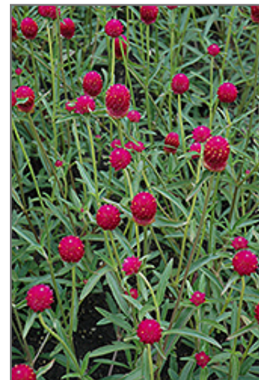
Qis Carmine Gomphrena flowers