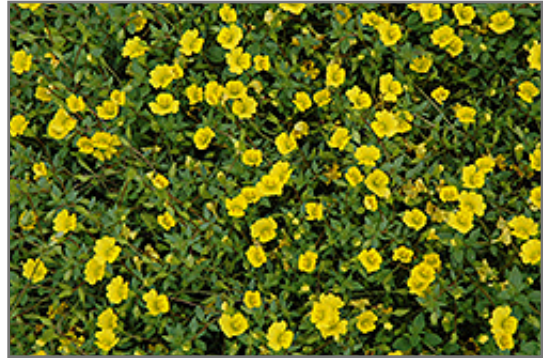
Magic Carpet Yellow Mecardonia flowers

Magic Carpet Yellow Mecardonia is recommended for the following landscape applications;