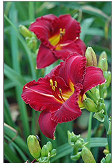
Pygmy Prince Daylily flowers