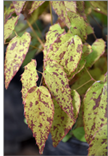
Pink Champagne Fairy Wings foliage

Pink Champagne Fairy Wings is a fine choice for the garden, but it is also a good selection for planting in outdoor pots and containers. Because of its spreading habit of growth, it is ideally suited for use as a 'spiller' in the 'spiller-thriller-filler' container combination; plant it near the edges where it can spill gracefully over the pot. Note that when growing plants in outdoor containers and baskets, they may require more frequent waterings than they would in the yard or garden.