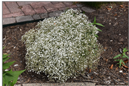
Summer Sparkles Baby's Breath in bloom