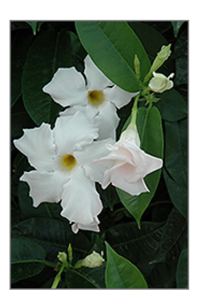
Sun Parasol Giant White Mandevilla flowers

When grown indoors, Sun Parasol Giant White Mandevilla can be expected to grow to be about 10 feet tall at maturity, with a spread of 24 inches. It grows at a medium rate, and under ideal conditions can be expected to live for approximately 20 years. This houseplant will do well in a location that gets either direct or indirect sunlight, although it will usually require a more brightly-lit environment than what artificial indoor lighting alone can provide. It requires an evenly moist well-drained soil for optimal growth. The surface of the soil shouldn't be allowed to dry out completely, and so you should expect to water this plant once and possibly even twice each week. Be aware that your particular watering schedule may vary depending on its location in the room, the pot size, plant size and other conditions; if in doubt, ask one of our experts in the store for advice. It is not particular as to soil type or pH; an average potting soil should work just fine. Be warned that parts of this plant are known to be toxic to humans and animals, so special care should be exercised if growing it around children and pets.