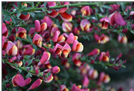
Burkwood's Broom flowers