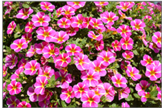
Superbells Rising Star Calibrachoa flowers

Superbells Rising Star Calibrachoa is a dense herbaceous annual with a trailing habit of growth, eventually spilling over the edges of hanging baskets and containers. Its medium texture blends into the garden, but can always be balanced by a couple of finer or coarser plants for an effective composition.