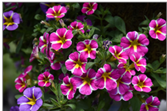
Superbells Rising Star Calibrachoa flowers