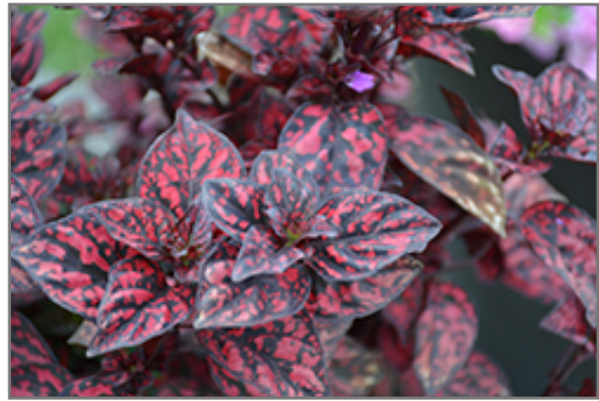
Hippo Red Polka Dot Plant foliage

Hippo Red Polka Dot Plant is recommended for the following landscape applications;