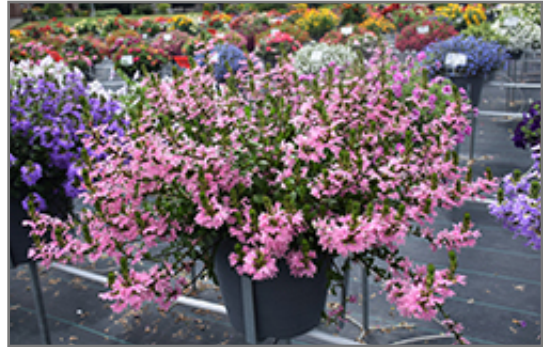
Whirlwind Pink Fan Flower in bloom

Whirlwind Pink Fan Flower is a fine choice for the garden, but it is also a good selection for planting in outdoor containers and hanging baskets. Because of its trailing habit of growth, it is ideally suited for use as a 'spiller' in the 'spiller-thriller-filler' container combination; plant it near the edges where it can spill gracefully over the pot. Note that when growing plants in outdoor containers and baskets, they may require more frequent waterings than they would in the yard or garden.