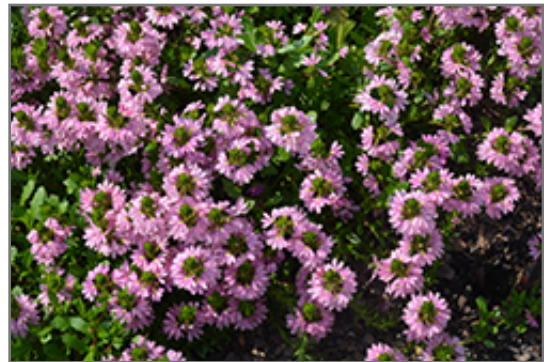
Whirlwind Pink Fan Flower flowers