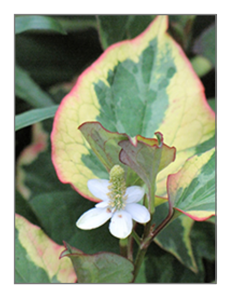
Chameleon Houttuynia flowers

Wolf Hill Ipswich 60 Turnpike Rd (Route 1) Ipswich, MA 01938 978-356-6342