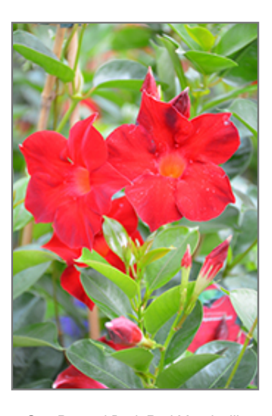
Sun Parasol Dark Red Mandevilla flowers

When grown indoors, Sun Parasol Dark Red Mandevilla can be expected to grow to be about 10 feet tall at maturity, with a spread of 24 inches. It grows at a medium rate, and under ideal conditions can be expected to live for approximately 20 years. This houseplant will do well in a location that gets either direct or indirect sunlight, although it will usually require a more brightly-lit environment than what artificial indoor lighting alone can provide. It requires an evenly moist well-drained soil for optimal growth. The surface of the soil shouldn't be allowed to dry out completely, and so you should expect to water this plant once and possibly even twice each week. Be aware that your particular watering schedule may vary depending on its location in the room, the pot size, plant size and other conditions; if in doubt, ask one of our experts in the store for advice. It is not particular as to soil type or pH; an average potting soil should work just fine. Be warned that parts of this plant are known to be toxic to humans and animals, so special care should be exercised if growing it around children and pets.