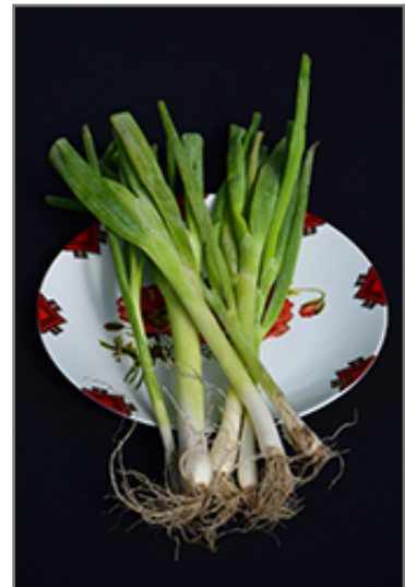
Spring Onion fruit