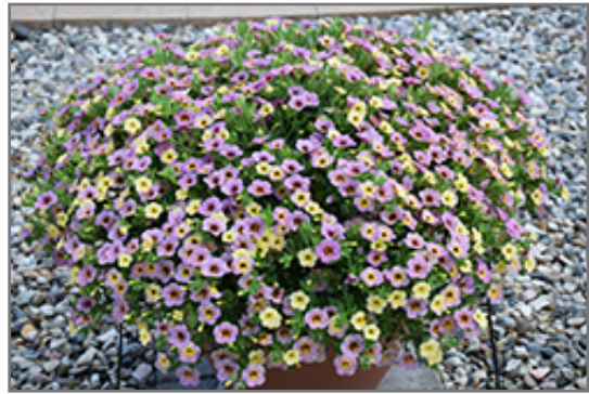
Chameleon Blueberry Scone Calibrachoa in bloom

Chameleon Blueberry Scone Calibrachoa is a fine choice for the garden, but it is also a good selection for planting in outdoor containers and hanging baskets. Because of its trailing habit of growth, it is ideally suited for use as a 'spiller' in the 'spiller-thriller-filler' container combination; plant it near the edges where it can spill gracefully over the pot. Note that when growing plants in outdoor containers and baskets, they may require more frequent waterings than they would in the yard or garden.