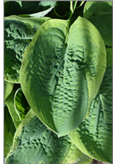
Frances Williams Hosta foliage

This plant does best in partial shade to shade. It prefers to grow in average to moist conditions, and shouldn't be allowed to dry out. It is not particular as to soil type or pH. It is somewhat tolerant of urban pollution. This particular variety is an interspecific hybrid. It can be propagated by division; however, as a cultivated variety, be aware that it may be subject to certain restrictions or prohibitions on propagation.