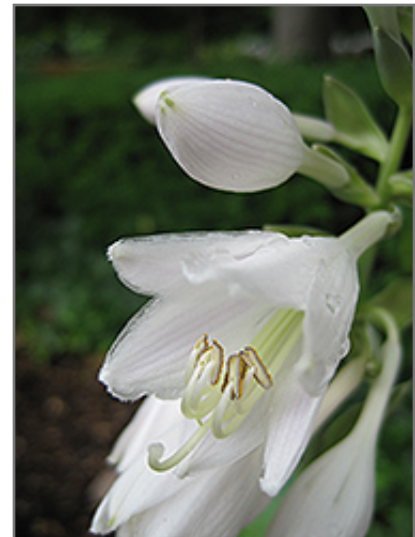
Frances Williams Hosta flowers