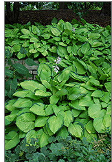
Gold Standard Hosta in bloom