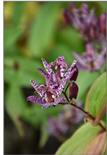
Toad Lily flowers