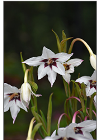
Abyssinian Gladiolus flowers

Abyssinian Gladiolus is recommended for the following landscape applications;