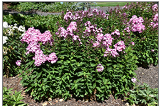
Volcano Pink with White Eye Garden Phlox in bloom