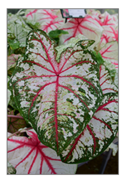
Tapestry Caladium foliage

Wolf Hill Gloucester 104 Eastern Ave Gloucester, MA 01930 978-281-4480