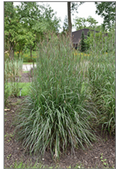
Blackhawks Bluestem in bloom