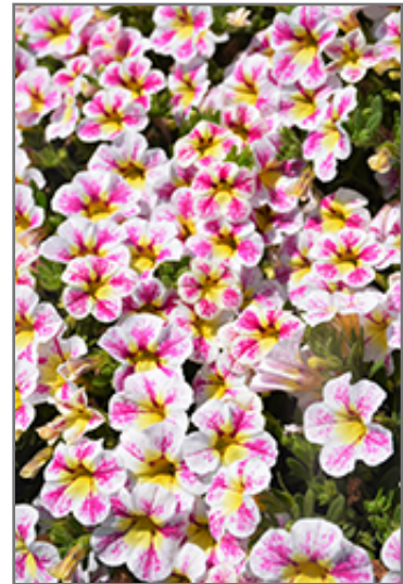
Superbells Holy Cow! Calibrachoa flowers

Superbells Holy Cow! Calibrachoa is a dense herbaceous annual with a trailing habit of growth, eventually spilling over the edges of hanging baskets and containers. Its medium texture blends into the garden, but can always be balanced by a couple of finer or coarser plants for an effective composition.