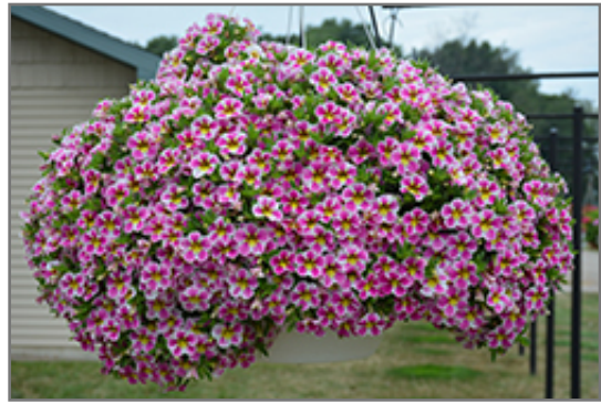
Superbells Holy Cow! Calibrachoa in bloom

Superbells Holy Cow! Calibrachoa is a fine choice for the garden, but it is also a good selection for planting in outdoor containers and hanging baskets. Because of its trailing habit of growth, it is ideally suited for use as a 'spiller' in the 'spiller-thriller-filler' container combination; plant it near the edges where it can spill gracefully over the pot. Note that when growing plants in outdoor containers and baskets, they may require more frequent waterings than they would in the yard or garden.