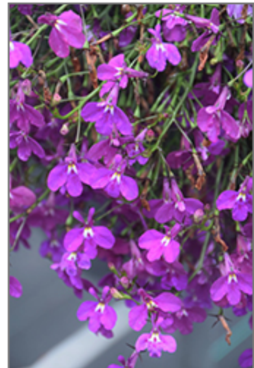
Laguna Ultraviolet Lobelia flowers