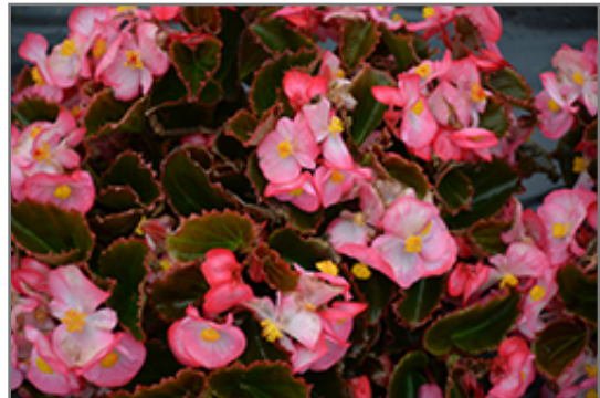
Senator IQ Rose Bicolor flowers