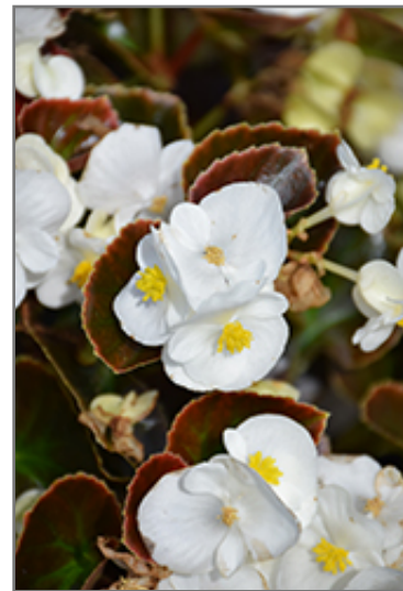
Senator IQ White flowers